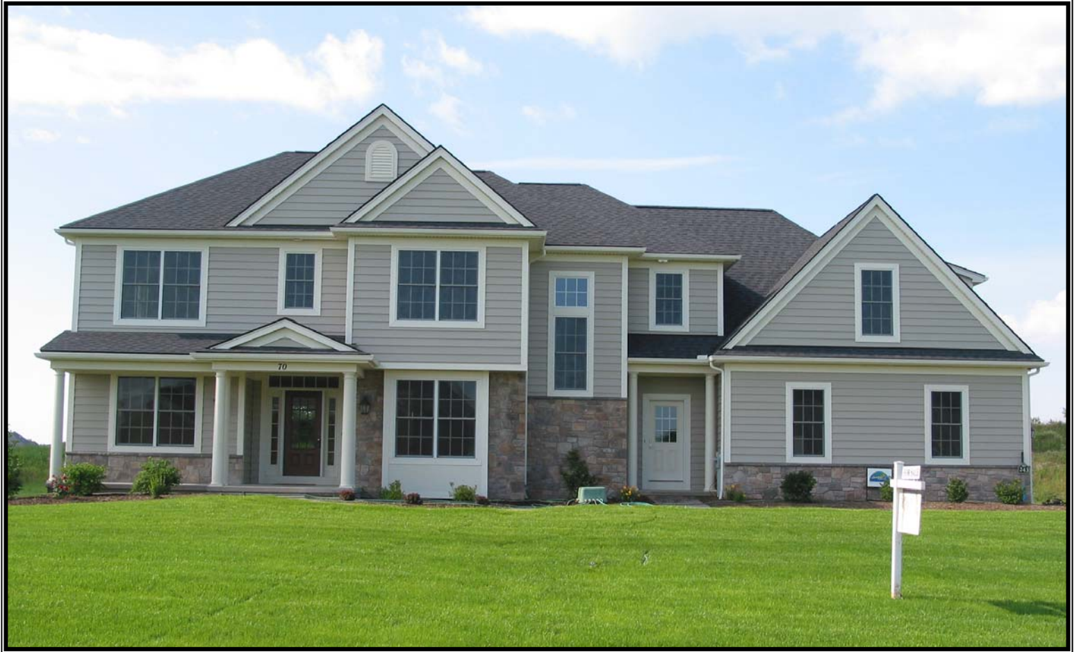
70 Mahogany Run - Pittsford, NY