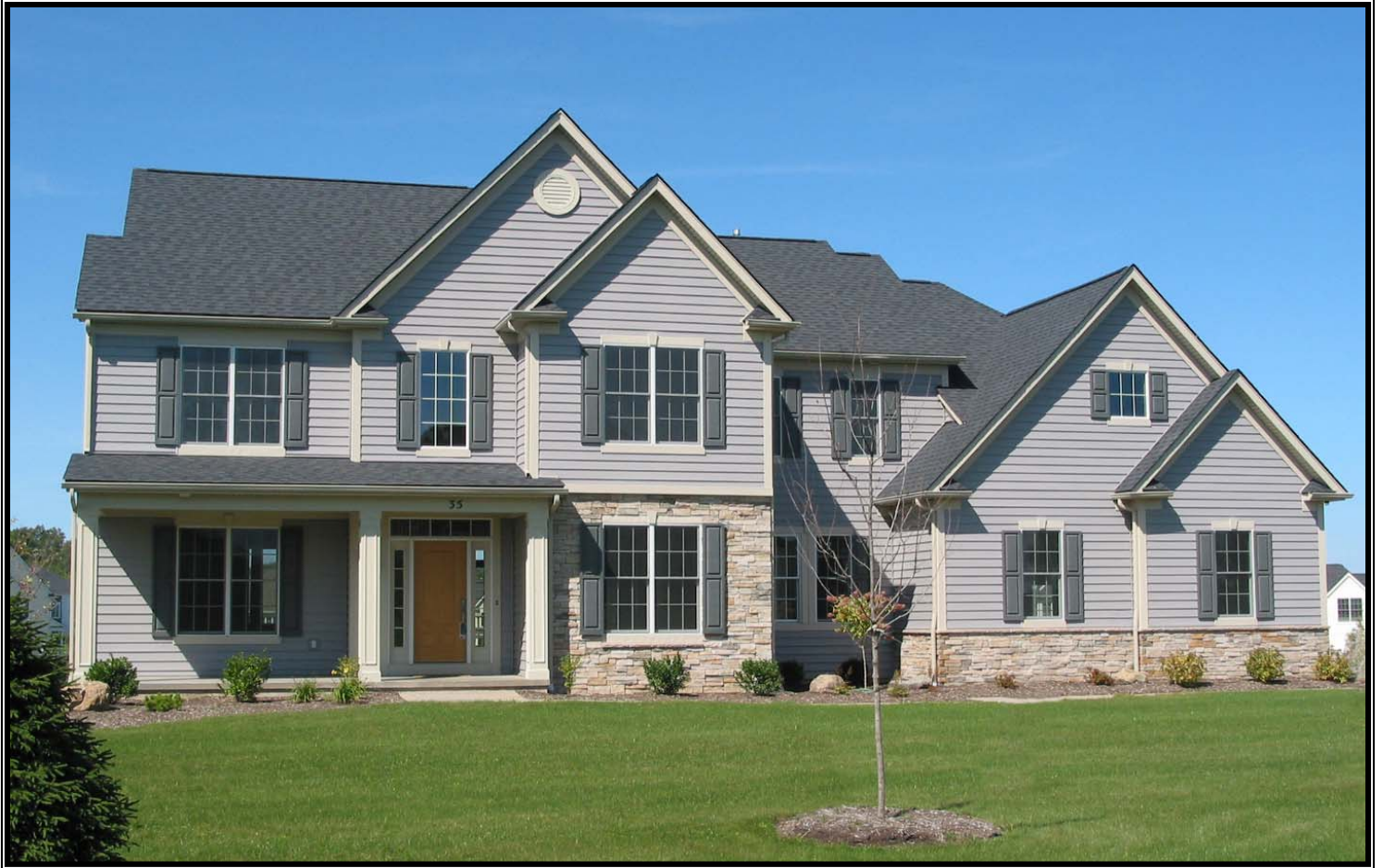
35 Turning Leaf Drive - Pittsford, NY