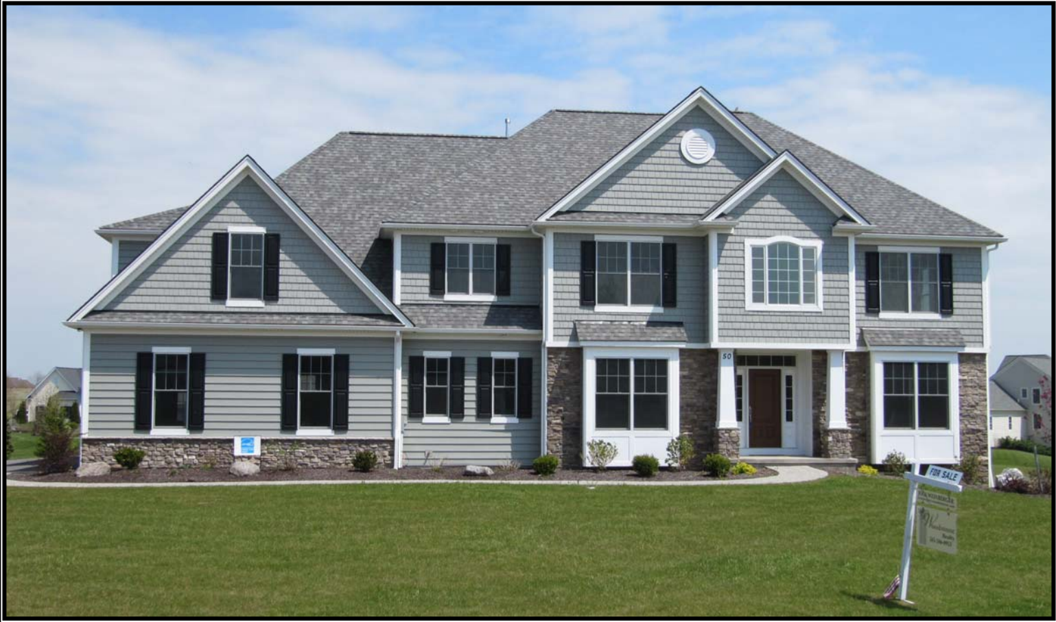
Lot 223 Autumn Woods - Pittsford, NY