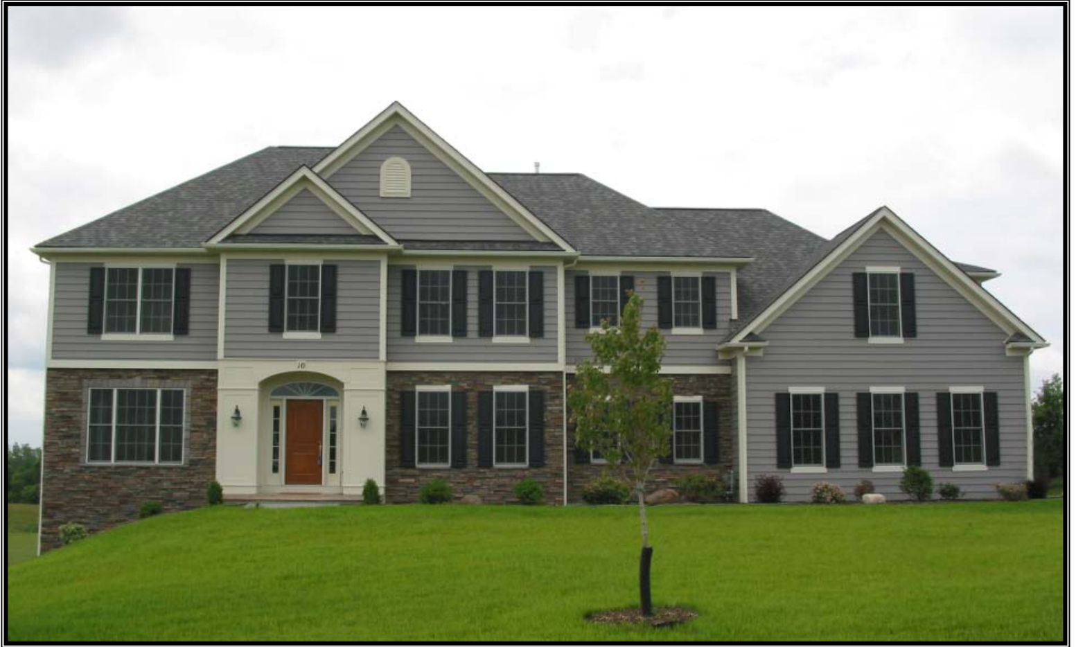
10 Dunnewood Court - Pittsford, NY