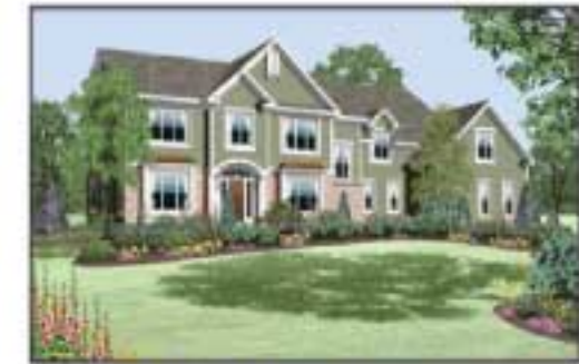
121 Autumn Woods

All dimensions are approximate and designs are subject to field variations.