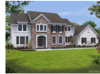
Lot 108 Autumn Woods