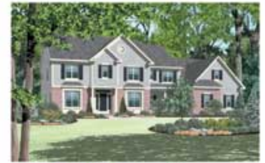
Lot 104 Autumn Woods

All dimensions are approximate and designs are subject to field variations.